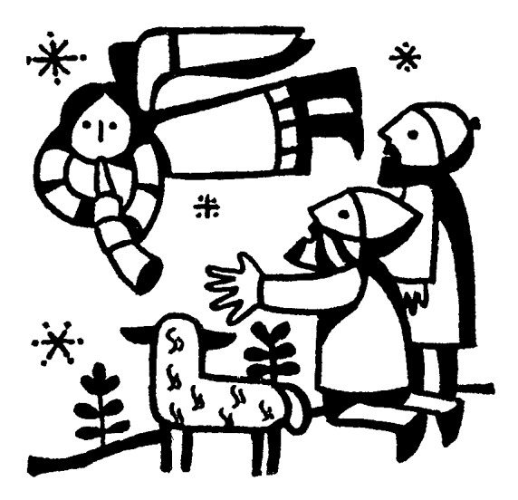
L come to proclaim good news to you

Then the Ministers and the People may greet one another in the name of the Lord.