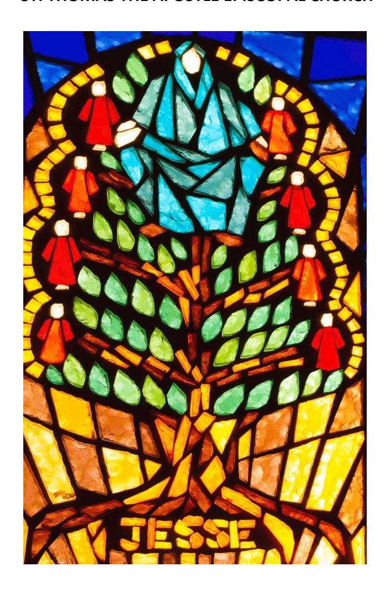
The Fourth Sunday of Advent Holy Eucharist Rite II Saturday, December 23, 2023 5:30 pm