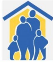
Johnson County IHN Serving the homeless since 2004

Our next St. Thomas Host week serving situationally homeless families and single women will be May 8-15, 2022 . The IHN guests will stay evenings and overnight here at St. Thomas, sleeping in classrooms converted to sleeping rooms. With help from our Support Congregations, we will also provide all meals. We are blessed by the opportunity to serve others.