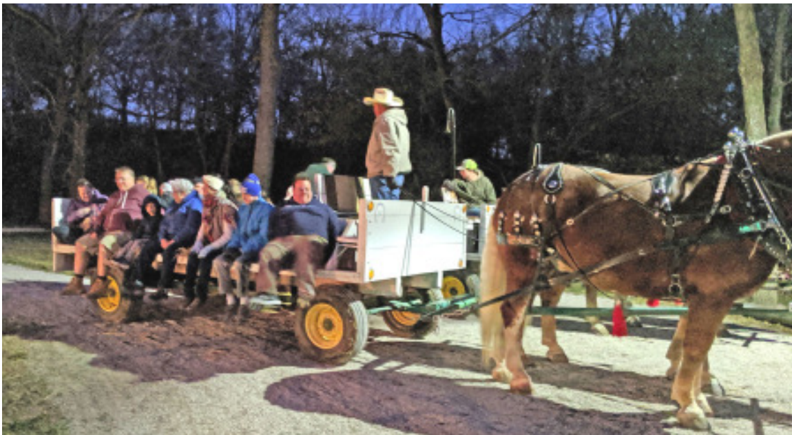
The St. Thomas Hayride took place on November 3 rd , a beautiful Fall evening, with about 75 members and friends in attendance.